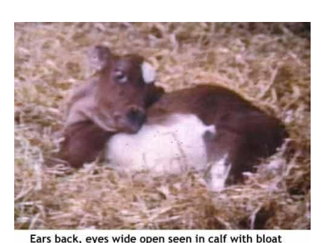
Figure I from www.veted.ac.uk

Difficult as often sporadic Avoid abrasive feeds Avoid baling areas with thistles/foxgloves Fence off thorn bushes if possible