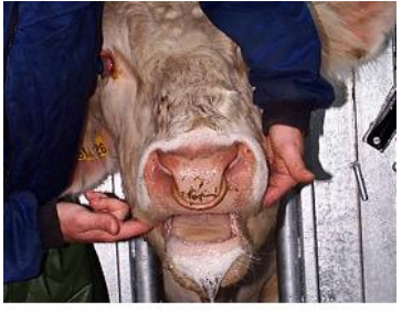
Figure II

-Swollen, hard and painful tongue that may protrude from mouth. -Excess salivation. -Inability to eat or swallow normally.